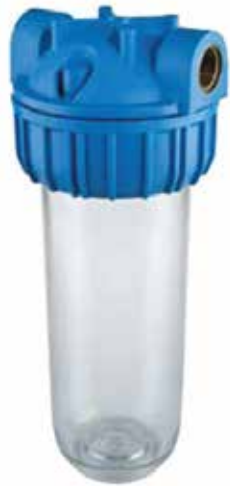
Pre filter 5 micron